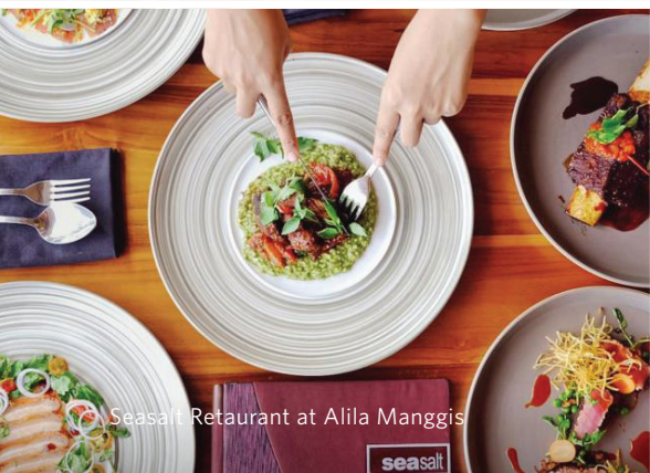
Seasalt Restaurant at Alila Manggis