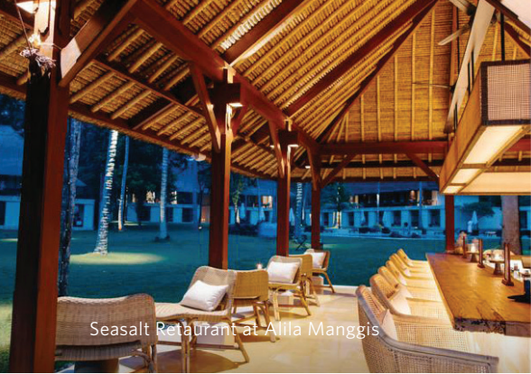
Seasalt Restaurant at Alila Manggis