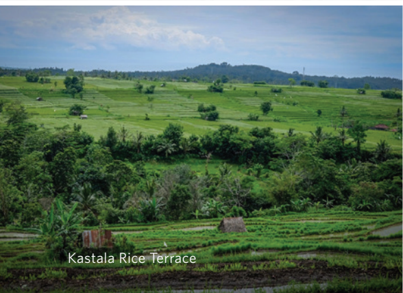
Kastala Rice Terrace