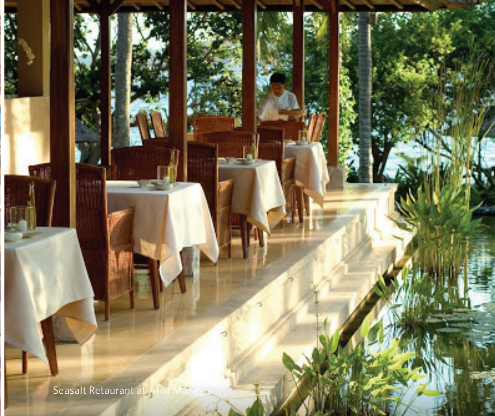
Seasalt Restaurant at Alila Manggis