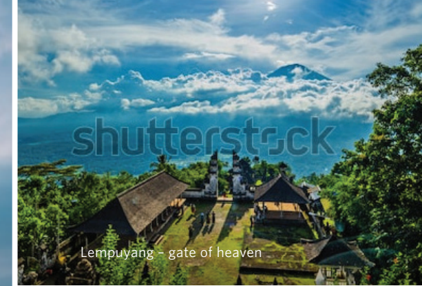
Lempuyang – gate of heaven