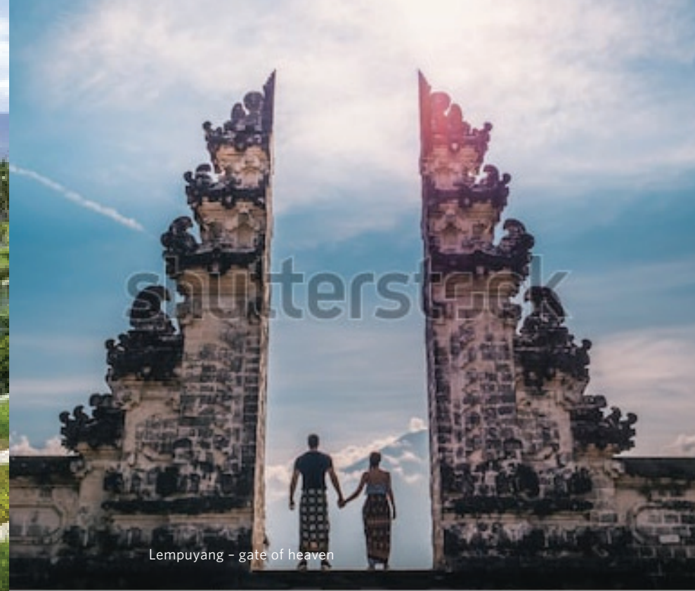
Lempuyang – gate of heaven

Jalan Sultan Agung, Karangasem, East Bali